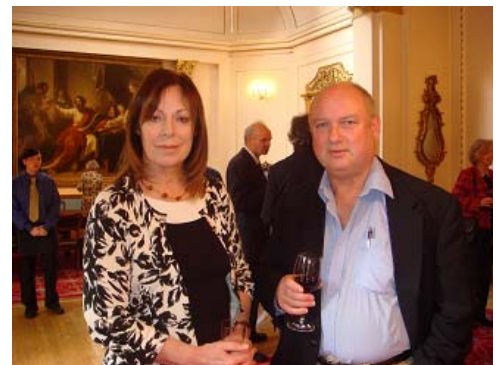
Rose Tremain & Louis de Bernières at the Literary Lunch

Guests flocked to this year's BAAF Literary Lunch to hear our guest speakers, Louis de Bernières, James Naughtie and Rose Tremain, talk about their work. Nearly 100 guests indulged in a wonderful lunch at the beautiful Stationers' Hall before listening to our fascinating authors. We are thrilled that the event raised nearly £17,000 for BAAF. We will be holding our next Literary Lunch in March 2010 so keep an eye out on our website for author news and how to buy your ticket!